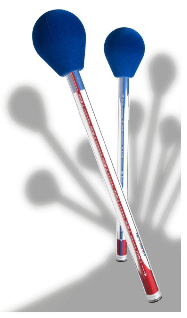
POD antennas for the frequency range 1-18 GHz