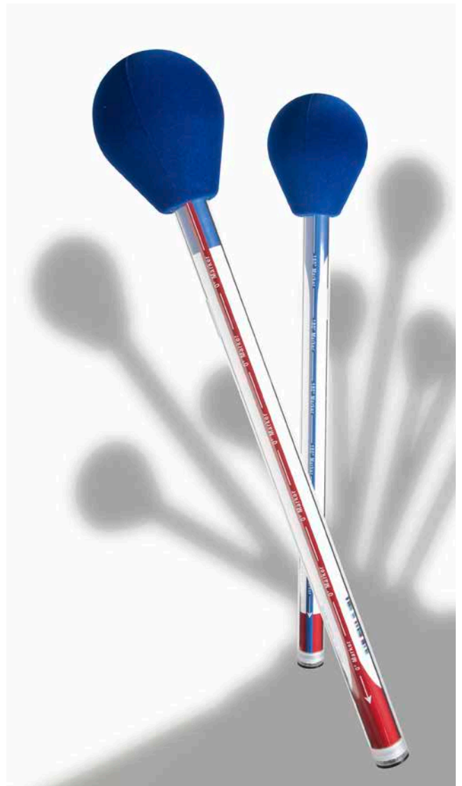
POD antennas for the frequency range 1-18 GHz